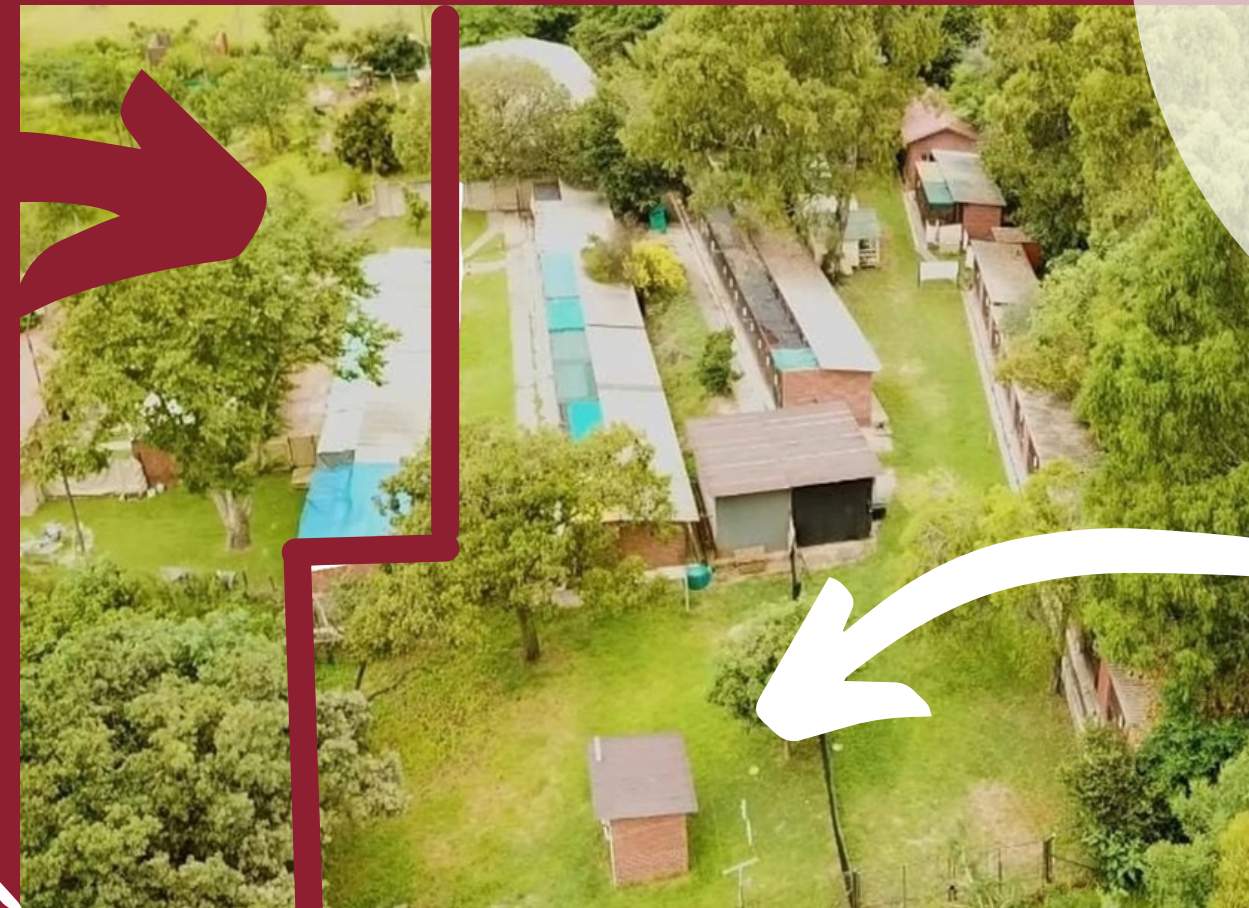
PDR CAMP & TOILET